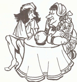
"Who cares about the future — where the hell was I last night?"

An excerpt from "A Rabbit Walks into a Bar: Best Jokes & Cartoons from AA Grapevine"